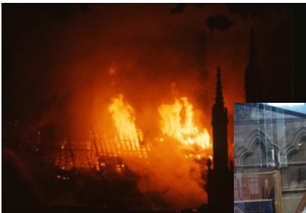
Above: The fire takes hold of York Minster in 1984