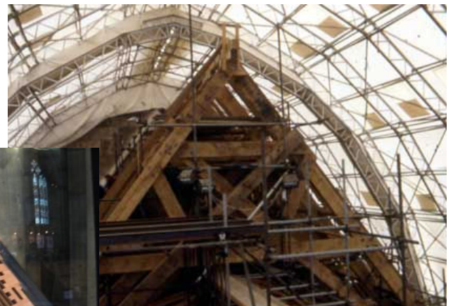
Above: The new roof trusses, treated by ProTen Services in place under a temporary roof during the restoration process