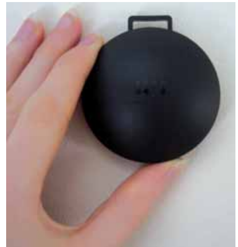
➤ Wall-mounted radon detector

The regulations require employers to keep exposure to radon below 400bq/m 3 by introducing, if necessary, control measures. As the air pressure inside a building is the main