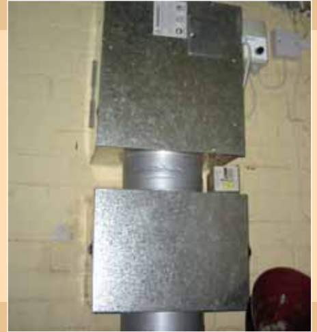
➤ Examples of positive pressure units installed by specialist contractors